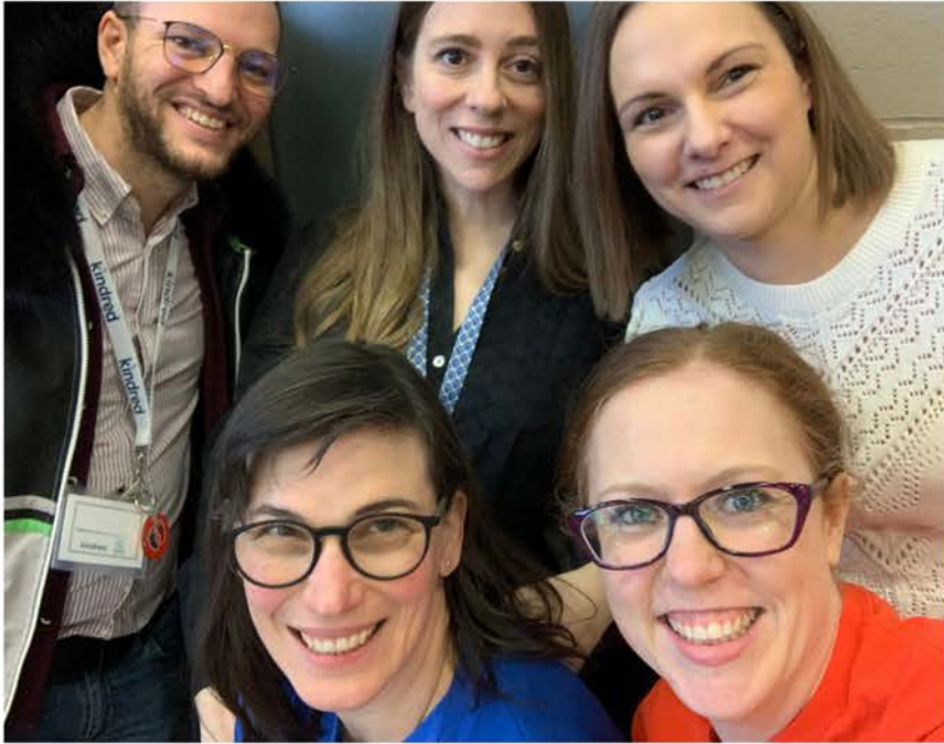
Kindred staff volunteering at Miskanawah's 17th Annual Friendship Round Dance

Miskanawah has two Family Resource Network Hubs that Kindred partners with in offering Rapid Access Counselling (RAC) as a spoke service. This past year, we had a RAC counsellor support at the Oskâpêwis Youth Program by offering counselling support to participants of the group.